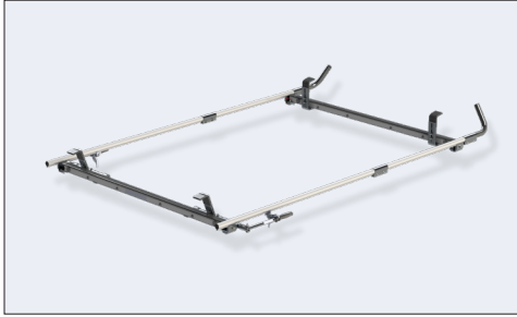
CC-PU2-62-M Dual Clamp