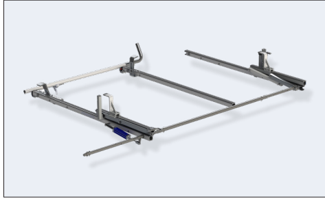
RR-GM-68-M Dual Rotation