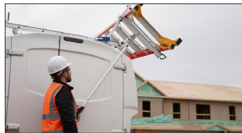
Hydraulically Dampened Descent