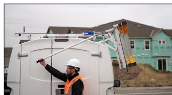
Built for Efficiency