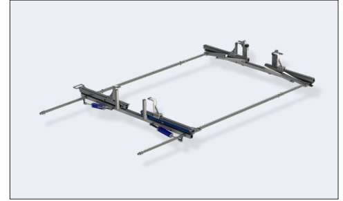
RR-NV200-62-M Dual Rotation