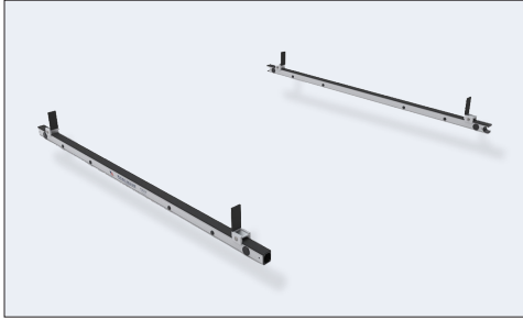
BB-FT-72-M Base Rack