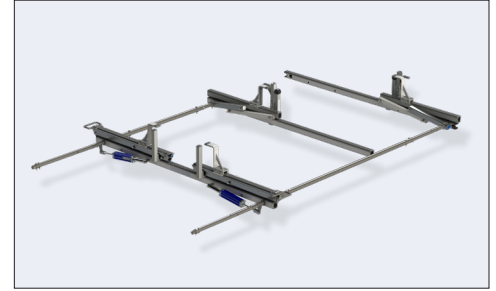
RR3-FT-72-M Dual Rotation w/ 3rd Crossbar