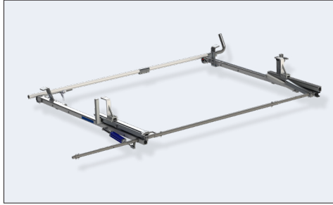
CR-TC-62-M Clamp / Rotation