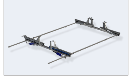
RR-TC-62-M Dual Rotation