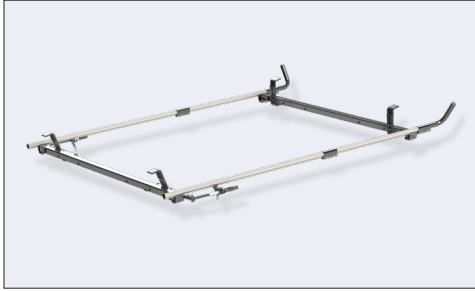
CC-TC-62-M Dual Clamp