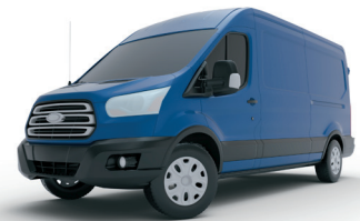
MEDIUM & HIGH ROOF